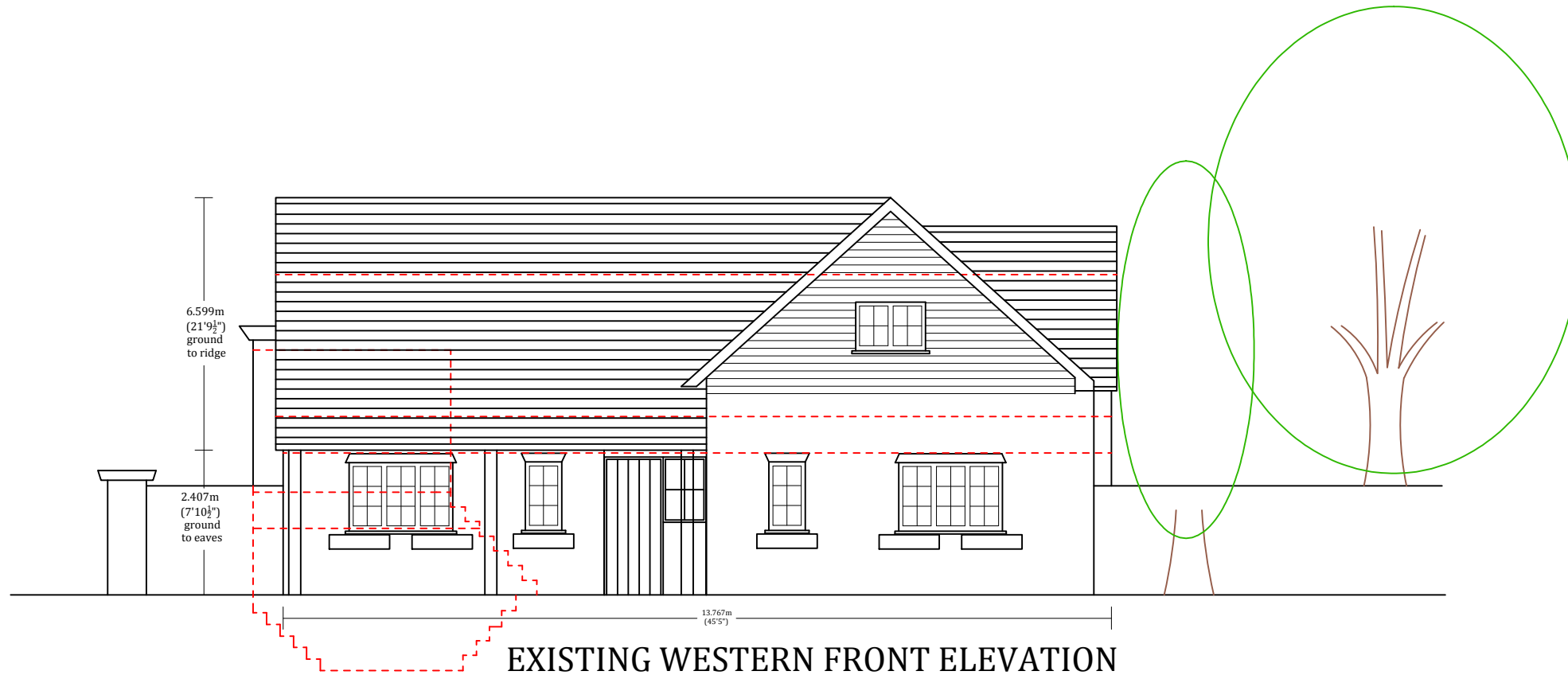
EXISTING WESTERN FRONT ELEVATION OF MAIN DWELLING 'NOLLSFIELD'