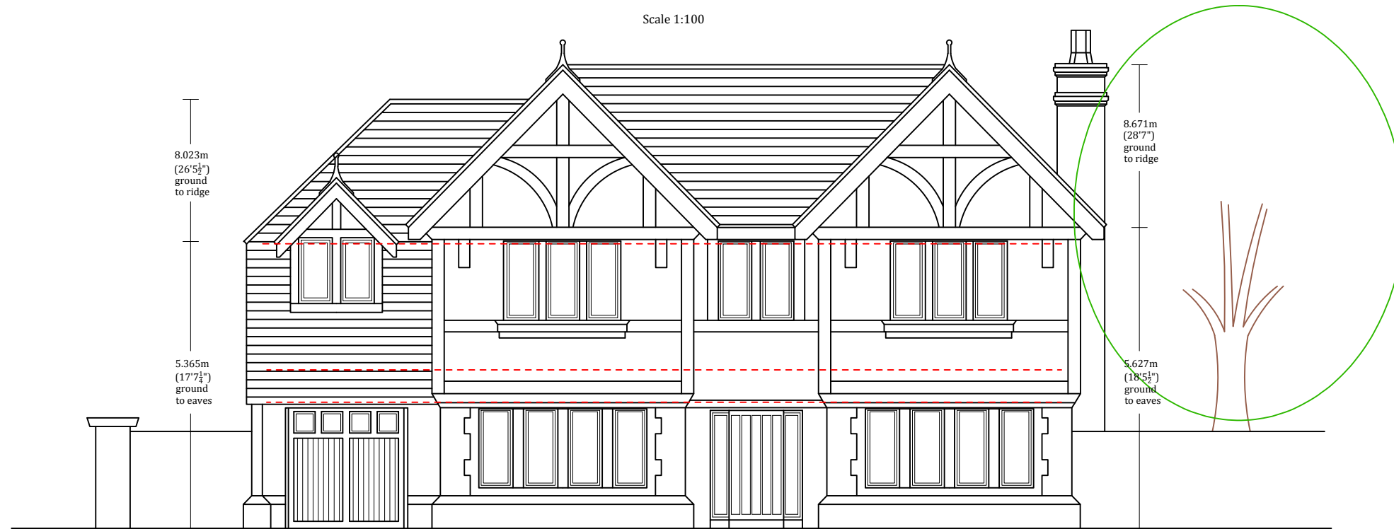
PROPOSED FRONT ELEVATION OF REPLACEMENT DWELLING